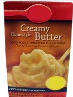
instant potato mix