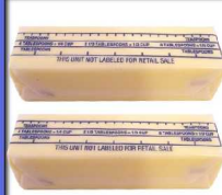
2 sticks butter