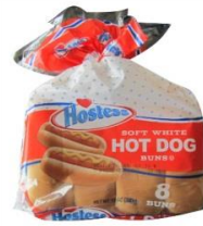
hot dog buns