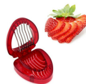
strawberry slicer (optional)