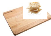
crackers on cutting board