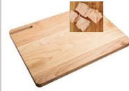
put to the side