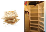
put crackers away