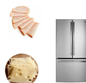
put meat and cheese away