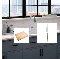
knife and cutting board in sink