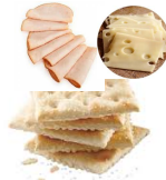
cheese and meat on cracker