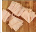
use knife to cut meat