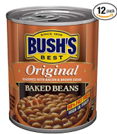
can of beans