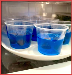
Allow Jell-O to set