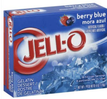
berry blast Jell-O