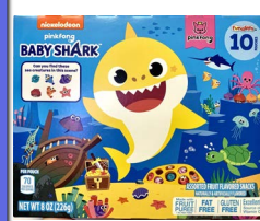
shark fruit snacks