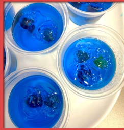
Remove from fridge