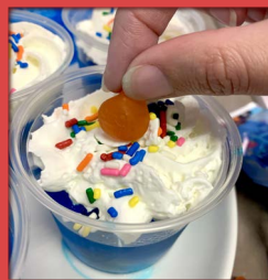
Add shark on top