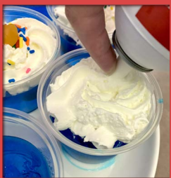
Add whipped cream