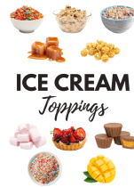
ICE CREAM Toppings other toppings of your choice