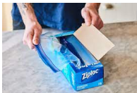
Get a bag